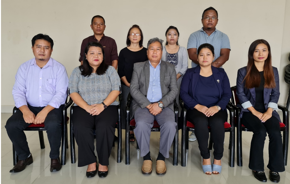
SAMETI STAFF – 2021