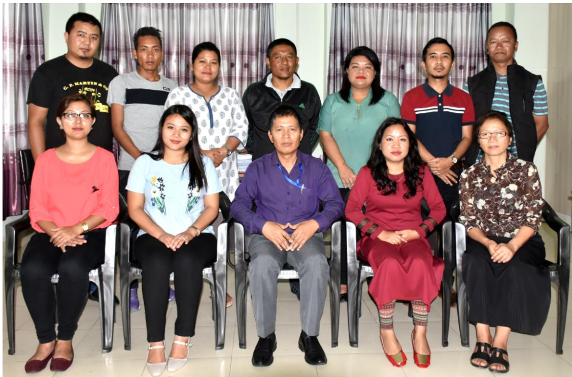
SAMETI STAFF - 2018